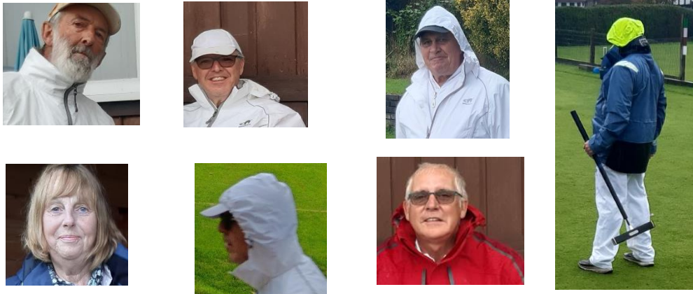
Wet weather montage

Every player deserved a medal by the end of this day. Torrential rain and unplayable conditions morphed into steady rain and squelchy courts in time for an only slightly late start – just as well really as part of the Garway team had been held up in stationary traffic for 45 minutes.