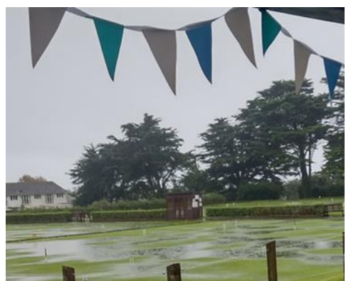
Above: a stalwart spectator – Right: Budleigh Lakes